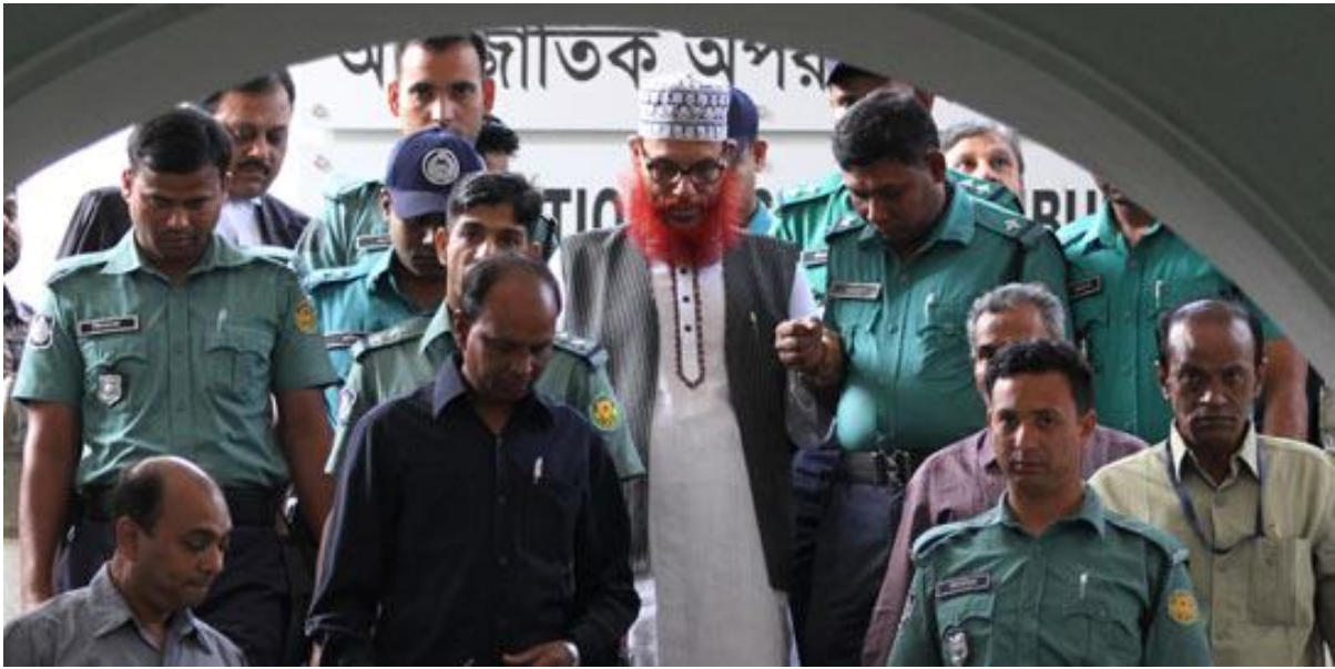
Jamaat-e-Islami Ameer Nayebe Ameer (Deputy Chief) Maulana Delwar Hossain Sayedee being brought to a controversial tribunal formed for the trial of war crimes committed in 1971.