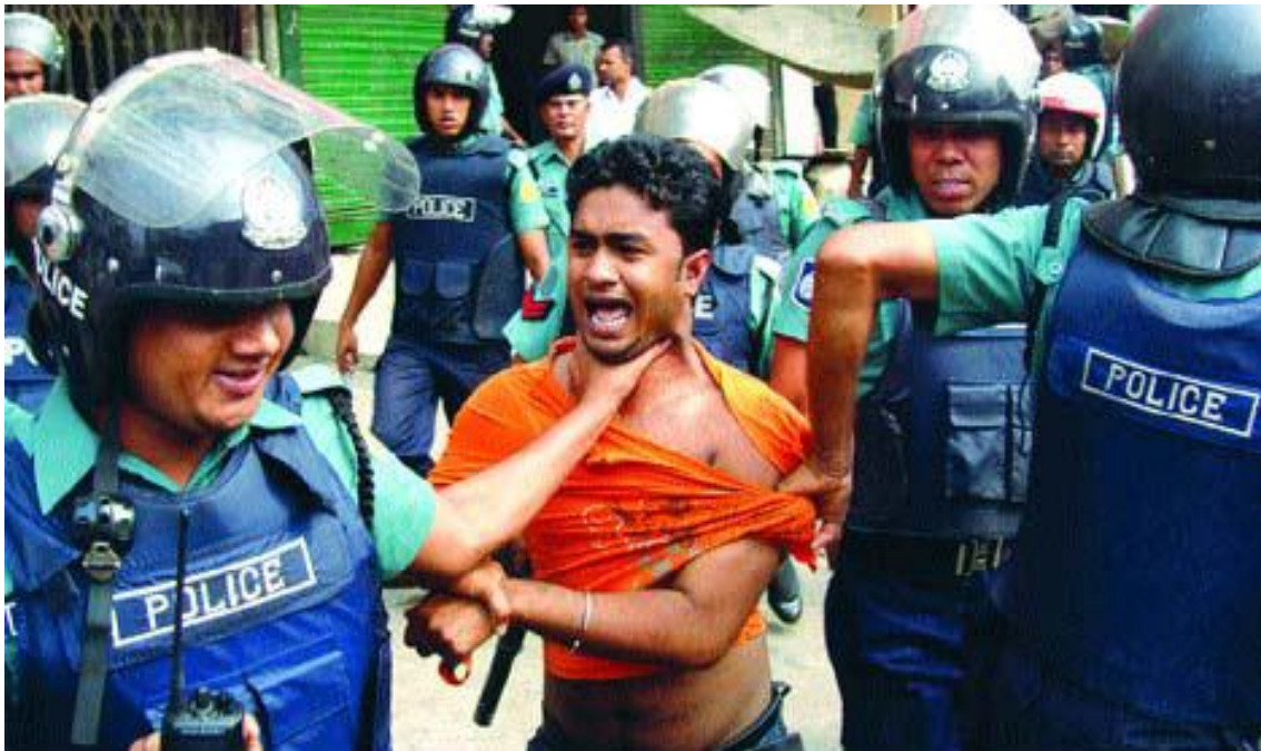
Police torturing a participant of the Independence Day rally arranged by Bangladesh Islami Chhatra Shibir on 26 March 2011.