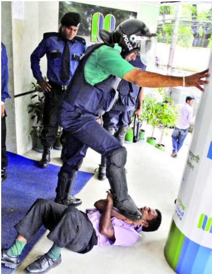
Police is torturing a picketer in Dhaka during a general strike called by the opposition parties on 22 September 2011.