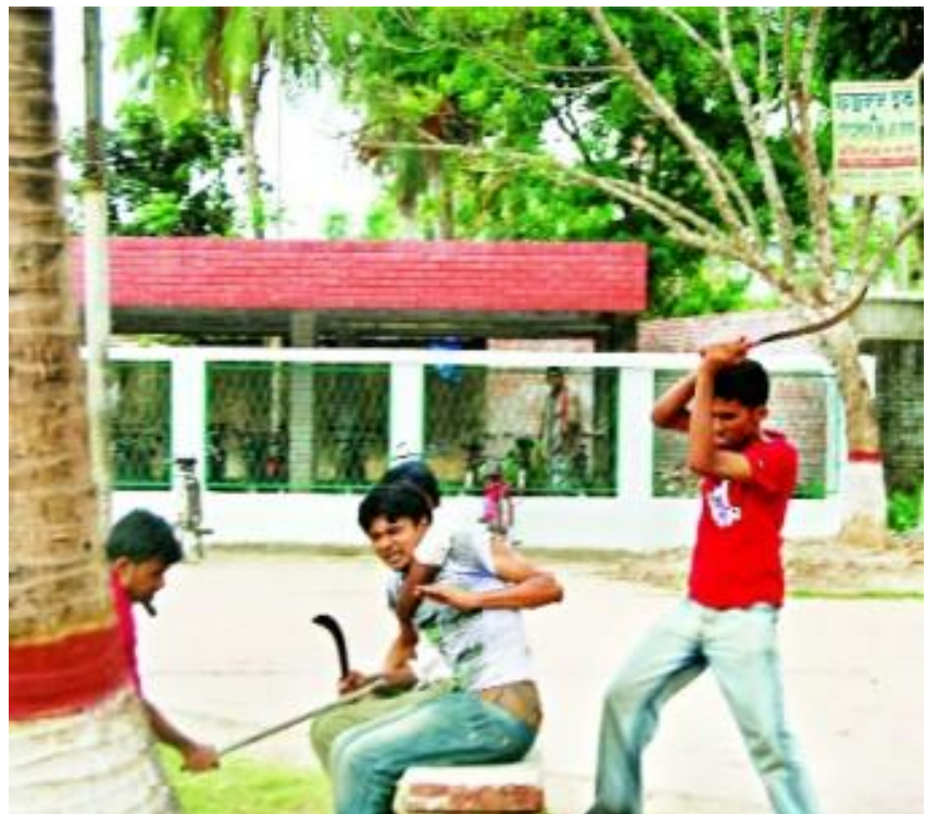
Chhatra League members attacking a student with sharp weapons in Barisal Polytechnic Institute during a clash on 4 June 2010.