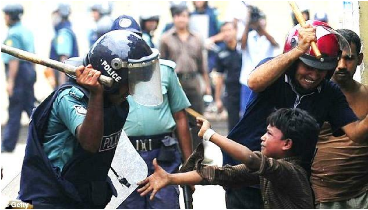
An innocent child is being beaten by police during a clash with garment workers in Dhaka.