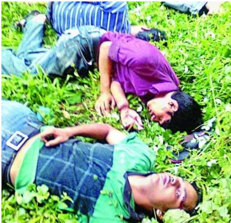
Jahangirnagar University students lay unconscious on the ground who were thrown over from 3 rd and 4 th floor of Al Beruni Hall by members of government backed Chhatra League during a clash on 6 July 2010.