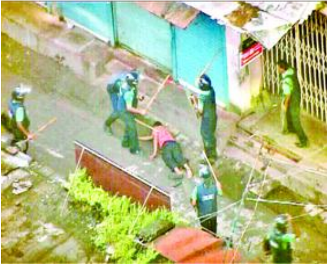
A Jamaat activist who participated in a rally being beaten up brutally by Police on 19 September 2011 in Dhaka.