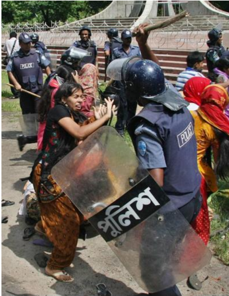
Police beating female students of Chittagong University who were participating to demonstration demanding the cancellation of charging additional admission fees on 3 March 2010.