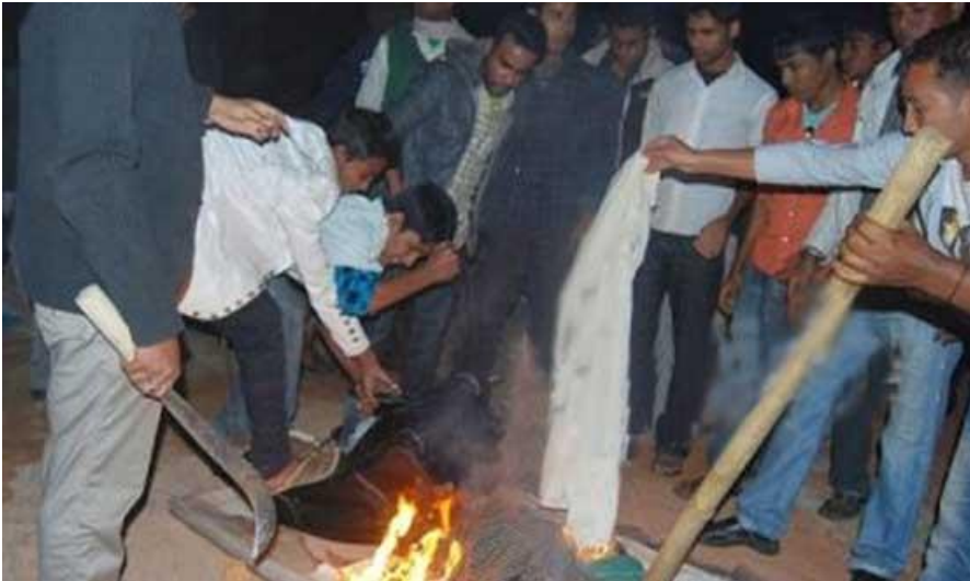
On 19 January 2012 after a procession following the arrest of BJI ex-Ameer Gulam Azam, BCL members conducted a sudden attack on rooms of BICS students and burned their effects in Shah Poran Residential Hall of Shahjala University of Science and Technology.