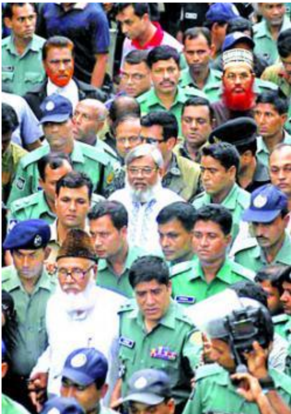
On 29 June 2010 Police arrested three top Jamaat leaders, Ameer-e-Jamaat Mawlana Motiur Rahman Nizami (Nizami), Naib-e-Ameer Mawlana Delwar Hossain Saydee (Saydee) and Secretary General Ali Ahsan Mujahid (Mujahid), in connection with a false case of hurting religious sentiment and they are detained till date in numerous cases filed by the government.