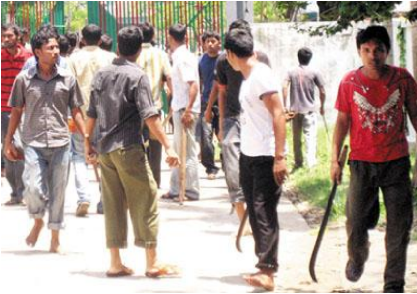
BCL activists with weapons in Sylhet Polytechnic Institute in a clash between two factions of the group leaving 10 injured on 16 May 2010.