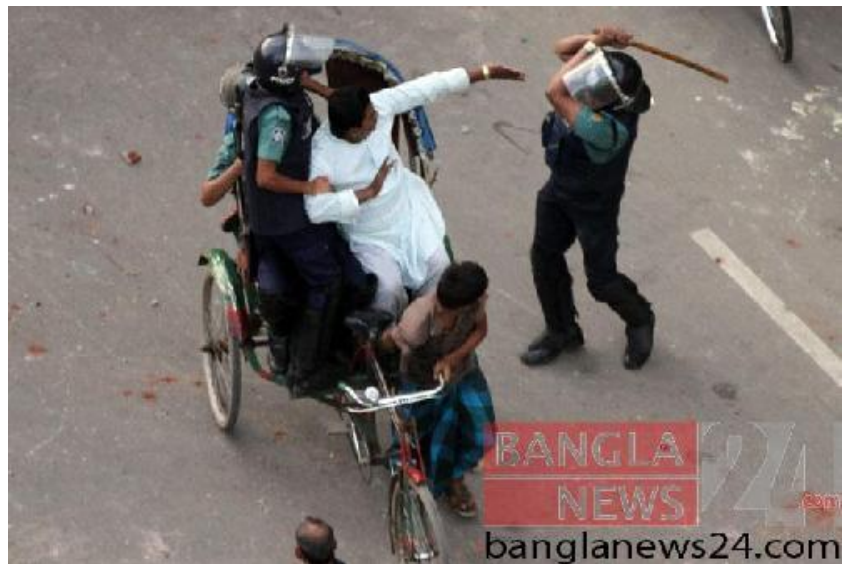
A pedestrian was trying to flee from police attack on 19 September 2011 in Dhaka, but he couldn't as police suspected him as Jamaat activist.