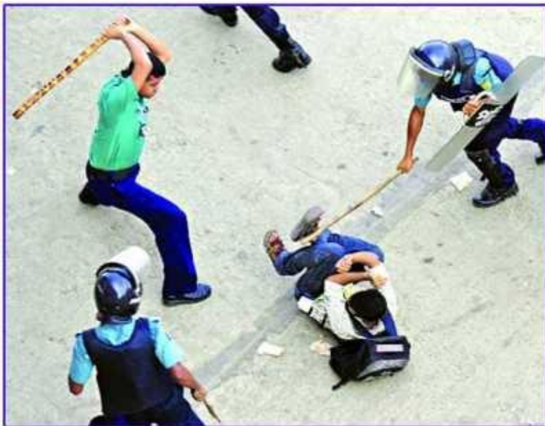
Brutal torture by policemen on a university student who took part in a demonstration against imposing tax on tuition fees in Dhaka on 20 July 2010.