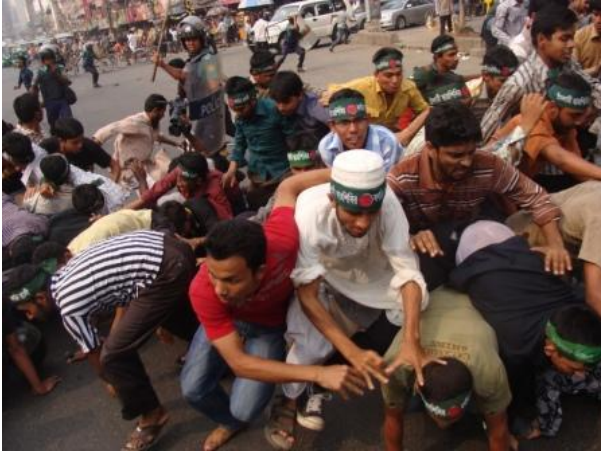
Police attack the Independence Day rally of Bangladesh Islami Chhatra Shibir on 26 March 2011.