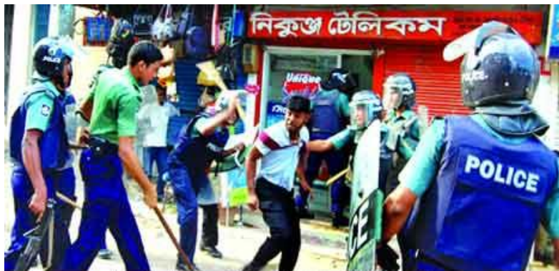
Police severely attacking on Jamaat-e-Islami procession in the capital Dhaka demanding the release of top its leaders leaving at least 10 people injured at the city's Malibagh area on 12 September 2011.