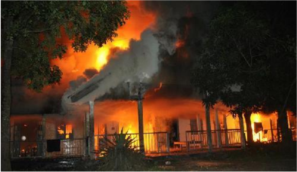
The student hostel of Government MC College of Sylhet was burned down by BCL in an attempt to keep general students out of the hostel on 8 July 2012.