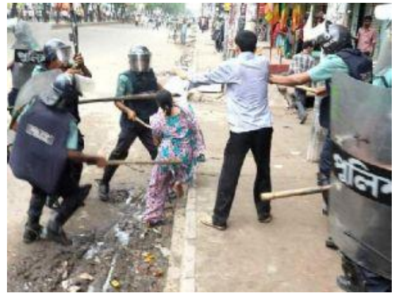
A woman under police torture during a general strike called by the opposition parties on 27 September 2011.